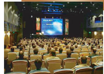
Steve Ballmer, Microsoft CEO.

"This application is amazing. It was developed using Syloway by Sylogist. What's amazing about it is that this application was developed -- designed and developed and ready to go out to production in one week."